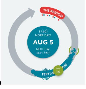
Figure 1. Phone apps predict a woman's next period or ovulation. Life (a) surfaces this prediction as a point estimate, while Clue (b) provides a range of potential dates.

system: "I'm not good at remembering to note the dates of my period in apps or paper calendars" ($132).