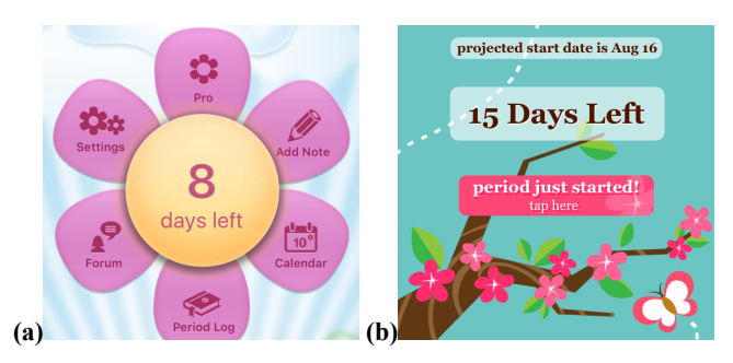
Figure 3. Period tracking apps often employ feminine, flowery, pink aesthetics. (a) is Period Diary, (b) is P. Tracker Lite.

Similar to barriers in other domains [12], people often forget to log their period. Most apps require logging both when a period starts and when it ends. Logging the end can be