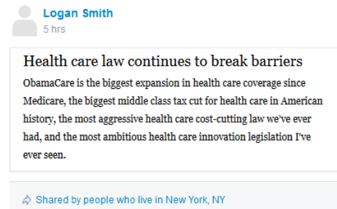
Fig. 1. Example of article and annotation

In this study, we evaluate whether aggregate, anonymous annotations about a reader's shared similarity with the sharers can raise their interest in reading political news articles, including viewpoint-challenging articles. Unlike work by Kulkarni & Chi, we do not reveal names. When people know specific friends have shared polarizing articles, they may unfriend them or hide their updates (Grevet